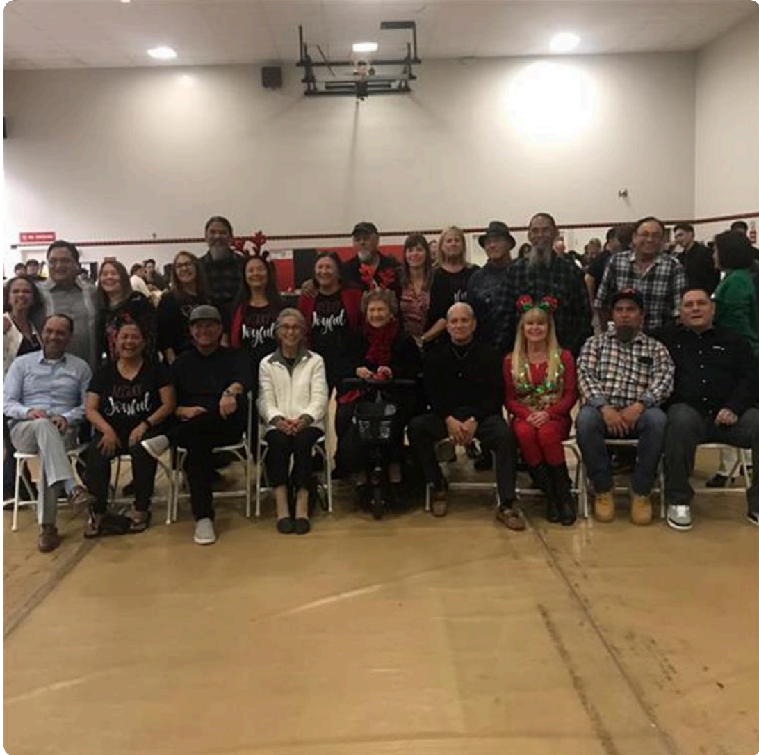
Bernardo Christmas 2019 Party